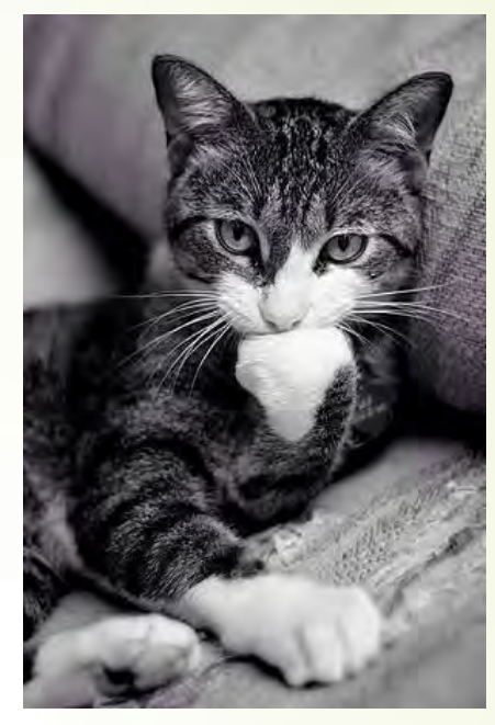
from We Love Cats and Kittens